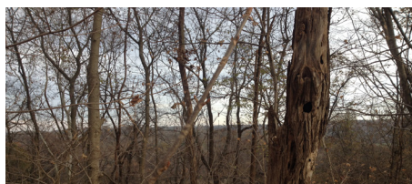
A wintertime view of our newest preserve.

We are impressed with the neighbors on Riverview Drive. Thank you for taking action to protect the natural heritage of southeast Indiana!